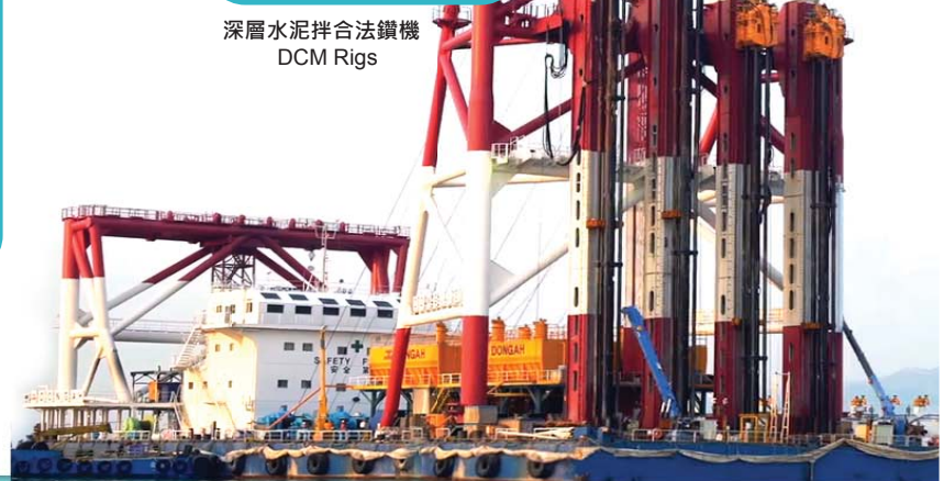
深層水泥拌合法工程船 Barge for DCM

The DCM rigs are drilled into designated depth under the seabed, cement is then injected and mixed with the soft mud in the contaminated mud pits, strengthening it into cement clusters.