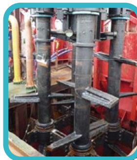
深層水泥拌合法鑽機 DCM Rigs

In these areas, Airport Authority Hong Kong uses Deep Cement Mixing (DCM) technology, a non-dredge method, to strengthen the soft mud for the reclaimed land.