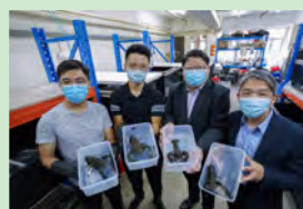
媒体采访 Media Interview