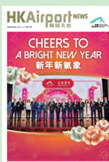
香港国际机场网站 HKIA Website 翱翔天地月刊（电子版及印刷版）及新闻故事 HK Airport News Newsletter (Electronic & Print) and News Stories https://www.hongkongairport.com/sc/airport-authority/publications/hkia-news/index.page https://www.hongkongairport.com/en/airport-authority/publications/hkia-news/index.page https://www.hongkongairport.com/sc/media-centre/news-stories-updates/ https://www.hongkongairport.com/en/media-centre/news-stories-updates/