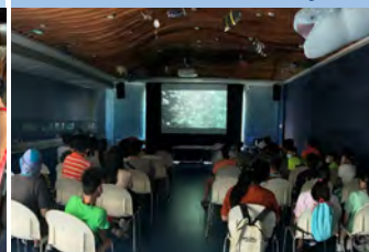
中华白海豚纪录片公众放映会 Public screening of documentary on Chinese White Dolphin