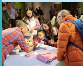
鲸豚影像解剖工作坊 Workshop on Cetacean Virtopsy