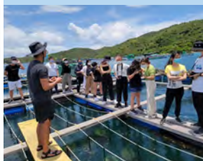
推广珍珠养殖技术的生态旅游 Ecotours to promote pearl farming techniques