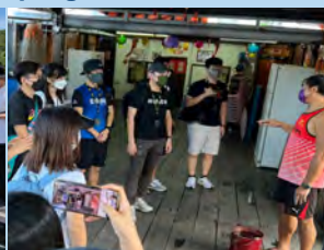
参观大澳棚屋以推广本地渔业文化 Visits to Tai O stilt houses to promote local fishing culture