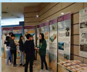
中国鲎生态及保育展览 Exhibition on the ecology and conservation of Chinese Horseshoe Crabs