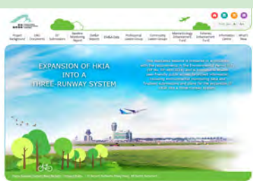
三跑道系统工程专题网站 3RS Project Dedicated Website https://env.threerunwaysystem.com/sc/index.html https://env.threerunwaysystem.com/en/index.html

发布专题报导及宣传片，以宣传获资助项目的研究发现及成果。 Feature stories and videos are published to promote findings and outcomes of funded projects.