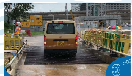
在工地出口安裝車輪清洗設施為車輛的輪胎除去塵埃 Install wheel washing facilities at construction site exit to wash off dust from wheels of vehicles