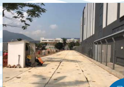
以可重用的混凝土、含瀝青的硬填料或金屬板覆蓋臨時通道，避免塵土飛揚 Temporary access are paved with reusable concrete, bituminous hardcore materials or metal plates to minimise dust generation