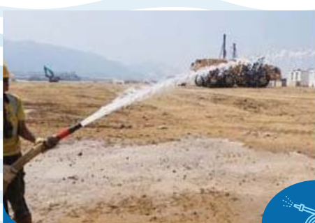
工人定時向工地灑水 Workers regularly hose works area