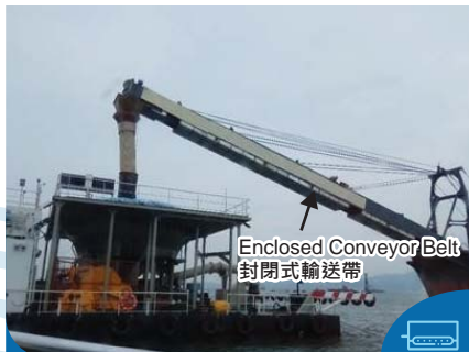
使用封閉式輸送帶運送填料 Using enclosed conveyor belt to transport fill materials

During the expansion of Hong Kong International Airport into a Three-runway System (3RS), in order to minimise adverse impact on air quality, Airport Authority Hong Kong has requested all 3RS marine-based and land-based contractors to implement a series of dust suppression measures to enforce dust controls and reduce dust emissions.