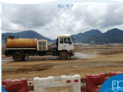
水車定期在工地的主要運輸路線上灑水 Water bowlers spray and dampen the main haul road regularly