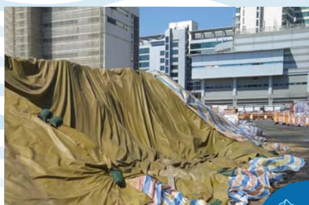
以不滲透的隔塵布覆蓋儲料區 Covering stockpiling areas with impervious sheets