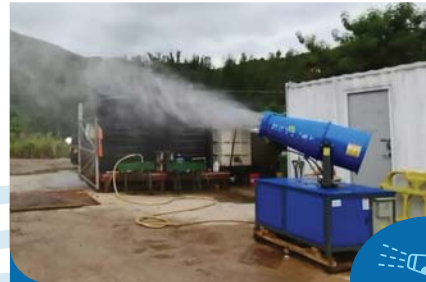
使用自動噴霧器保持建築物表面及工地濕潤 Using automatic mist sprayer to dampen the surface of construction materials and the site