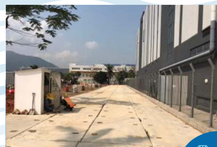
以可重用的混凝土、含瀝青的硬填料或金屬板覆蓋臨時通道，避免塵土飛揚 Temporary access are paved with reusable concrete, bituminous hardcore materials or metal plates to minimise dust generation