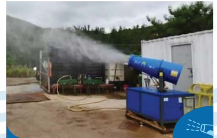
使用自動噴霧器保持建築物表面及工地濕潤 Using automatic mist sprayer to dampen the surface of construction materials and the site