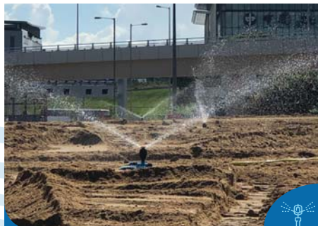
以360度自動花灑定期向填料灑水 Regularly using 360 degree automatic sprinkler to dampen fill materials