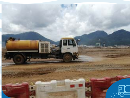
水車定期在工地的主要運輸路線上灑水 Water bowlers spray and dampen the main haul road regularly