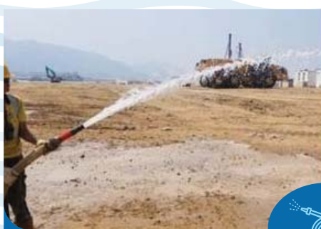
工人定時向工地灑水 Workers regularly hose works area