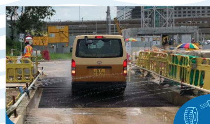
在工地出口安裝車輪清洗設施為車輛的輪胎除去塵埃 Install wheel washing facilities at construction site exit to wash off dust from wheels of vehicles