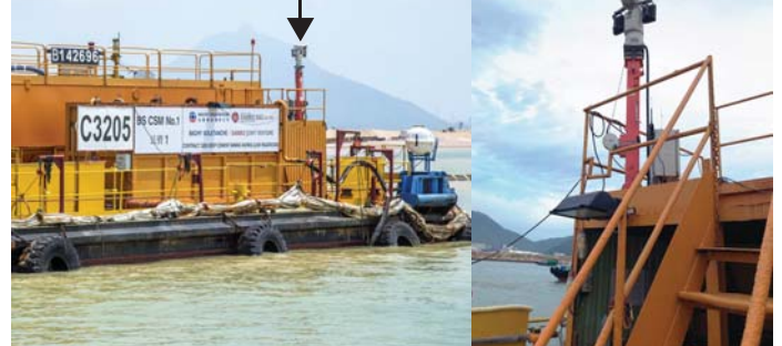
在工程船上安裝的閉路電視監察系統 CCTV installed on work barge

閉路電視監察系統安裝在工程船上，而觀察角度完全覆蓋海豚管制區範圍。已受訓練的海豚觀察員在承建商的工地辦公室內監察閉路電視的實時影像。