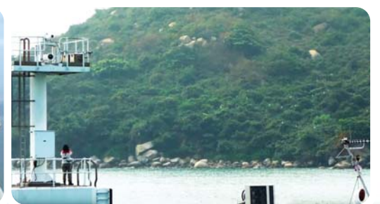
定期進行生態及水質監察 Regular ecological and water quality monitoring

更多有關定向鑽挖法的資訊: https://www.threerunwaysystem.com/tc/information/videos More about HDD: https://www.threerunwaysystem.com/en/information/videos