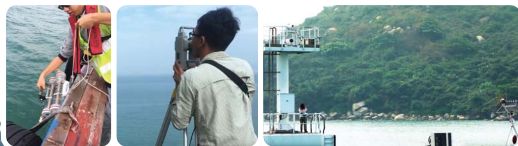
定期进行生态及水质监察 Regular ecological and water quality monitoring

更多有关定向钻挖法的资讯: https://www.threerunwaysystem.com/sc/information/videos More about HDD: https://www.threerunwaysystem.com/en/information/videos