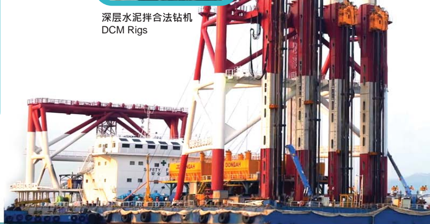
深层水泥拌合法工程船 Barge for DCM

深层水泥拌合法钻机会钻入预定的海床深度，然後注入水泥浆及搅拌，将水泥浆及污泥坑内的软泥混和，使软泥加固成为坚硬的水泥柱。 The DCM rigs are drilled into designated depth under the seabed, cement is then injected and mixed with the soft mud in the contaminated mud pits, strengthening it into cement clusters.