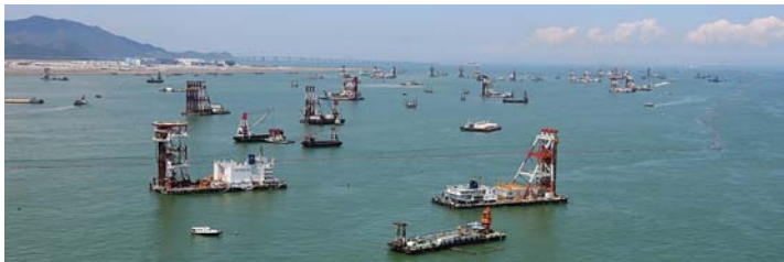
三跑道系統工程一般使用的自航及非自航推動船隻 Typical self-propelled and non-self-propelled 3RS related vessels

Construction of the Expansion of Hong Kong International Airport into a Three-runway System (3RS) involves more than 200 vessels due to the huge marine works area and complicated land formation activities sequences. Airport Authority Hong Kong has implemented Marine Travel Routes and Management Plan for Construction and Associated Vessels, and all construction vessels have to follow the plan.