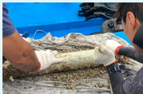
定期收回靜態聲音監測儀作數據下載 PAM devices are retrieved regularly for data download