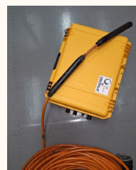
水底聲音監測儀 Hydrophone device

To further explore patterns of CWDs' habitat use, night-time hydrophone surveys are also conducted. Hydrophone systems are capable of covering and recording the entire known range of CWD vocalisation. During the surveys, conducted between 18:00 and 06:00 hours, the monitoring vessel tows a hydrophone along the transect lines in Northeast Lantau, Northwest Lantau and West Lantau. These night-time detections contribute to supplementing visual sightings collected during daytime vessel line-transect surveys. Since the commencement of monitoring works in 2022 and up to mid-2023, a total survey effort of over 1,900 km was conducted.