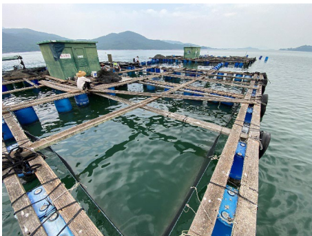
幼魚在魚排暫養以確保在投放前適應香港西面水域的海洋環境 Fingerlings were temporarily kept in fish farm for acclimatisation to ensure the fishes could adapt to the western Hong Kong waters prior to release