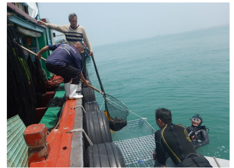
幼魚從運魚船轉移到投放位置 The fingerlings were transferred from fish carrier for on-location release