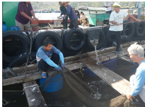
投放當天，幼魚從魚排小心地運往香港國際機場進口航道區的投放地點 Fish fingerlings were carefully transported from the fish farm to the release location at HKIAAA on the day of release