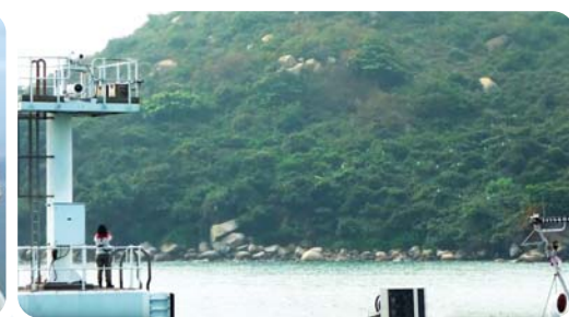
定期進行生態及水質監察 Regular ecological and water quality monitoring

更多有關定向鑽挖法的資訊: https://www.threerunwaysystem.com/tc/information/videos More about HDD: https://www.threerunwaysystem.com/en/information/videos