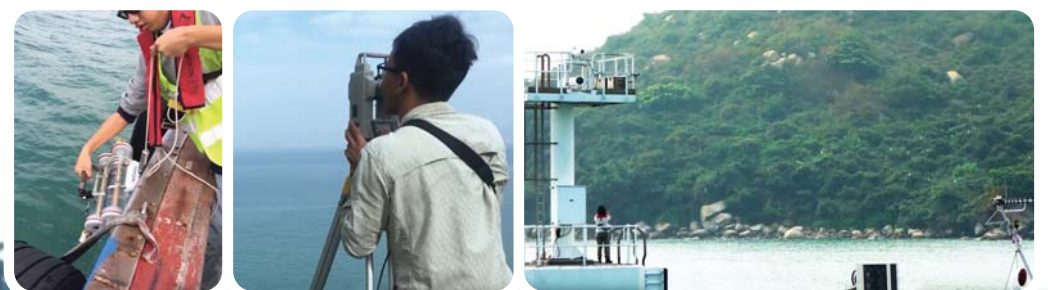
定期進行生態及水質監察 Regular ecological and water quality monitoring

更多有關定向鑽挖法的資訊: https://www.threerunwaysystem.com/tc/information/videos More about HDD: https://www.threerunwaysystem.com/en/information/videos