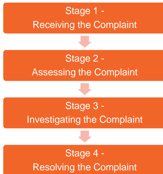
Figure 2.1: Overall Complaint Handling Process Flow Chart

Details of each of the stages in the handling process are described in the following sections. A detailed environmental complaint handling flow chart is shown in Appendix A .