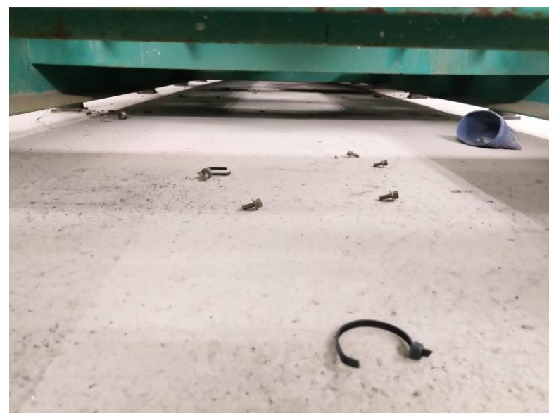
BH4 View 2 - concrete floor condition underneath Emergency Generator