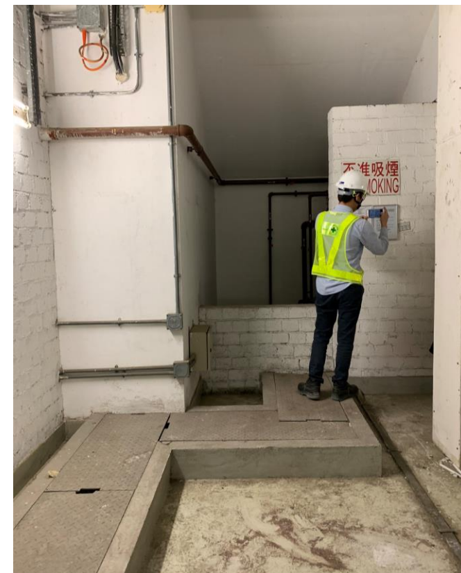
BH3 View 3 – Concrete curb surrounding fuel tank