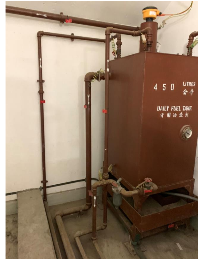
BH3 View 1 – Metal drip tray and concrete curb surrounding fuel tank