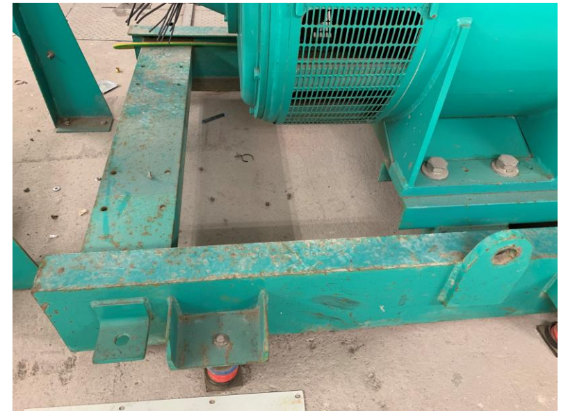
BH4 View 3 - concrete floor condition underneath Emergency Generator