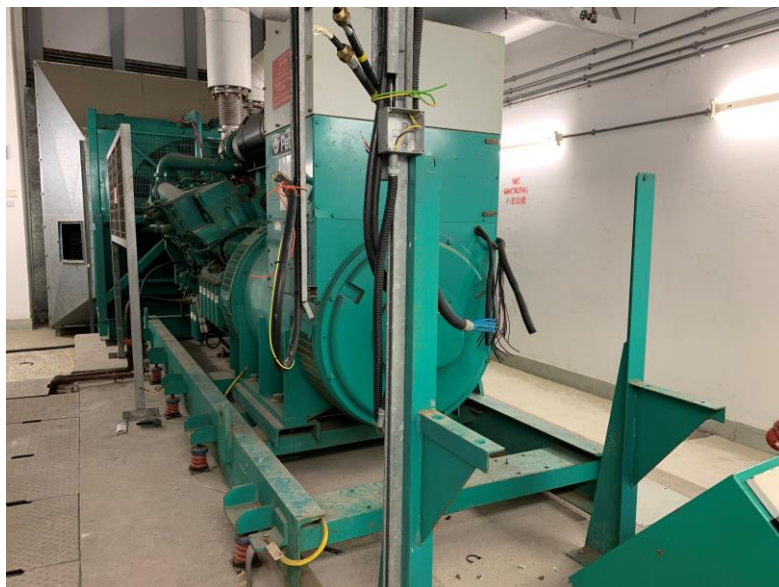
BH4 View 1 - Emergency Generator (BH4) (Mounted on 200mm-thick concrete plinth)