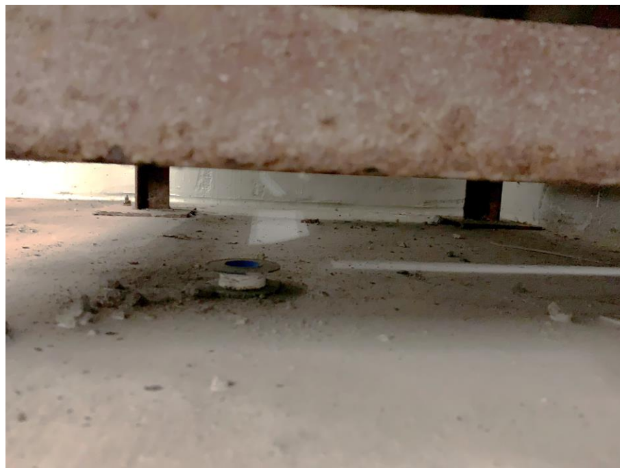
BH3 View 2 – concrete floor condition underneath 450 L fuel tank