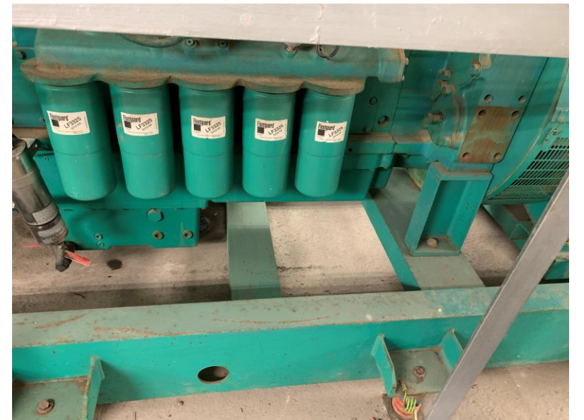
BH4 View 4 - concrete floor condition underneath Emergency Generator