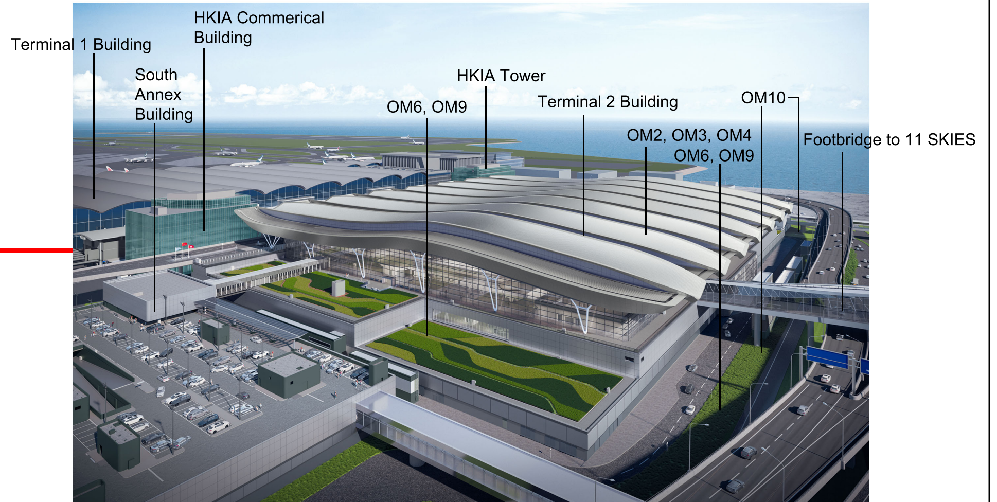
Artist's Impression of Terminal 2 (T2) Building