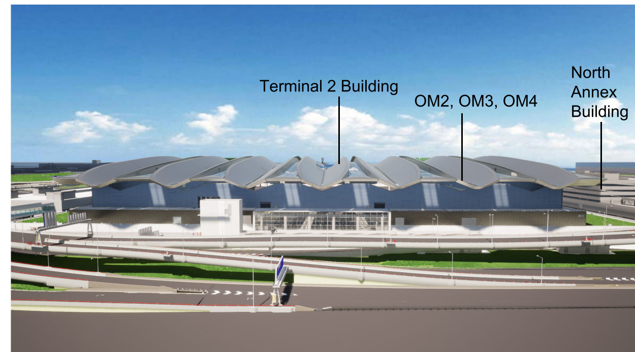
East side of Terminal 2 (T2) Building