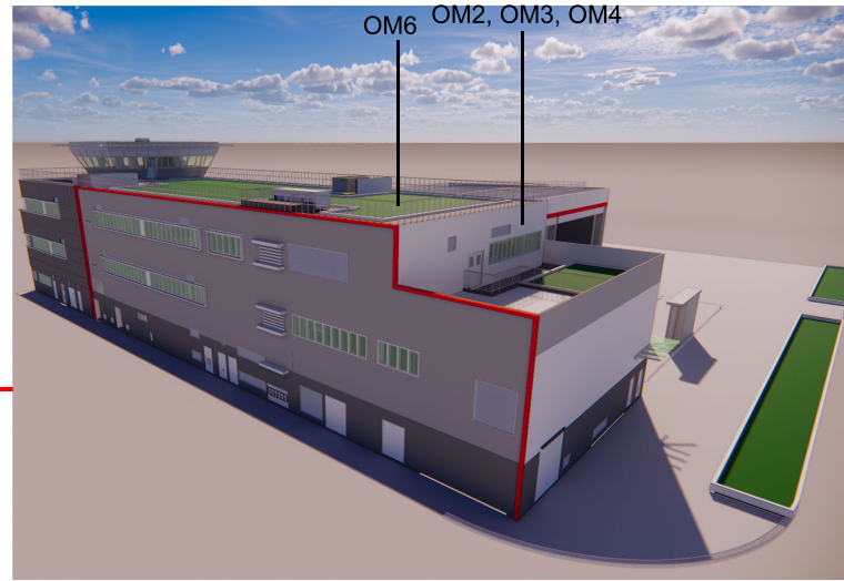
Airside Fire Station -Side view