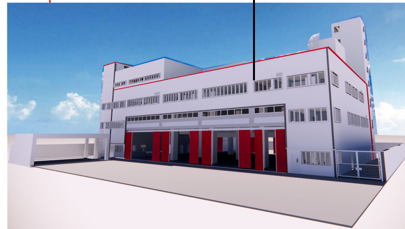
Landside Fire Station