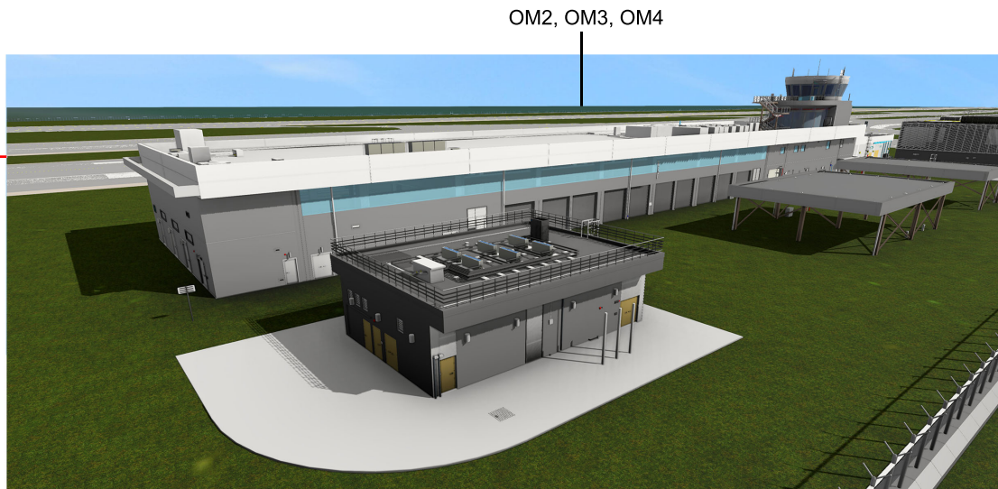
Communications Equipment Building C