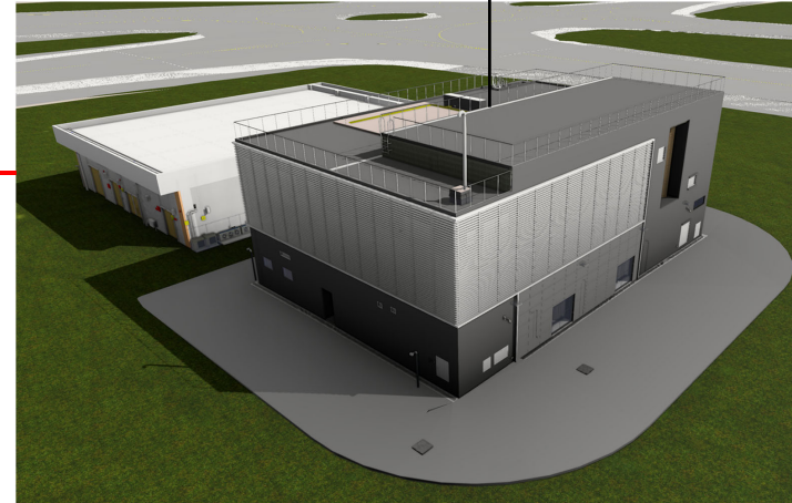
AFC Decontamination Facilities